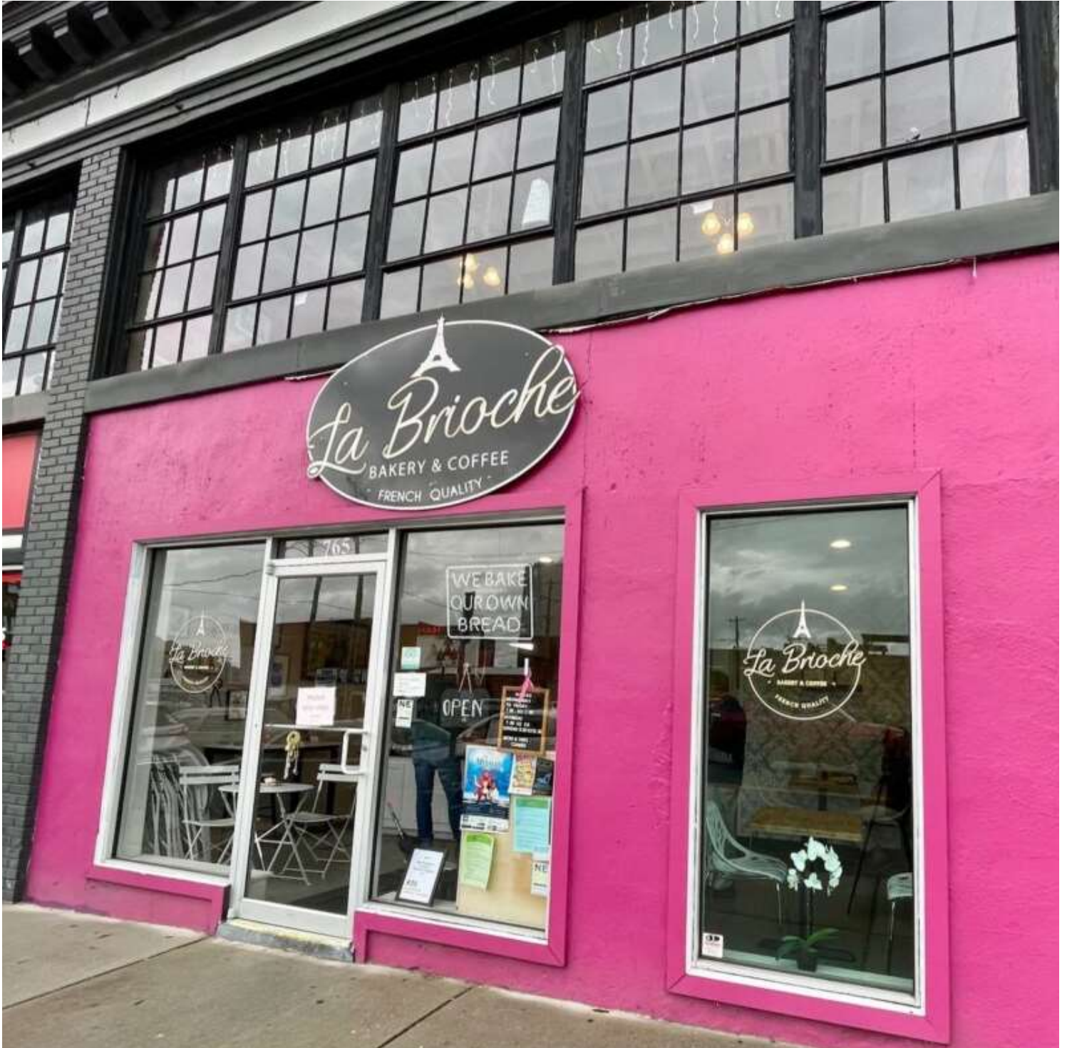
LA BRIOCHE IN NORFOLK, VIRGINIA