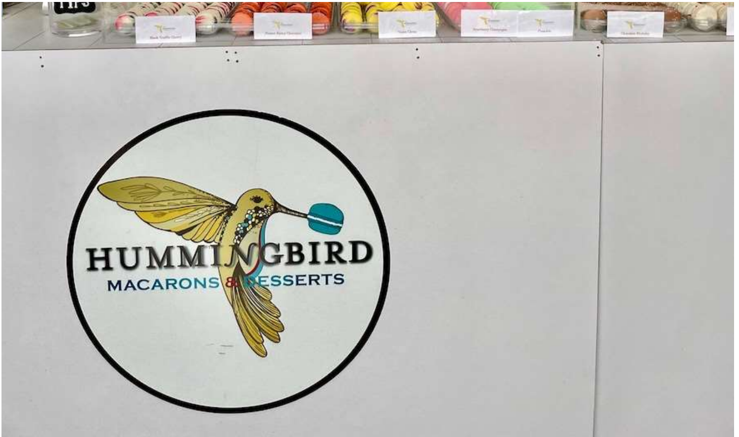
HUMMINGBIRD MACARONS AND DESSERTS IN THE NEON ARTS DISTRICT

Another fun stop in the Neon Arts District is Hummingbird Macarons and Desserts. All of the treats are homemade. Even if you're not hungry and can resist the sweet treats, stop in to see the pretty and very Instagramable interior.