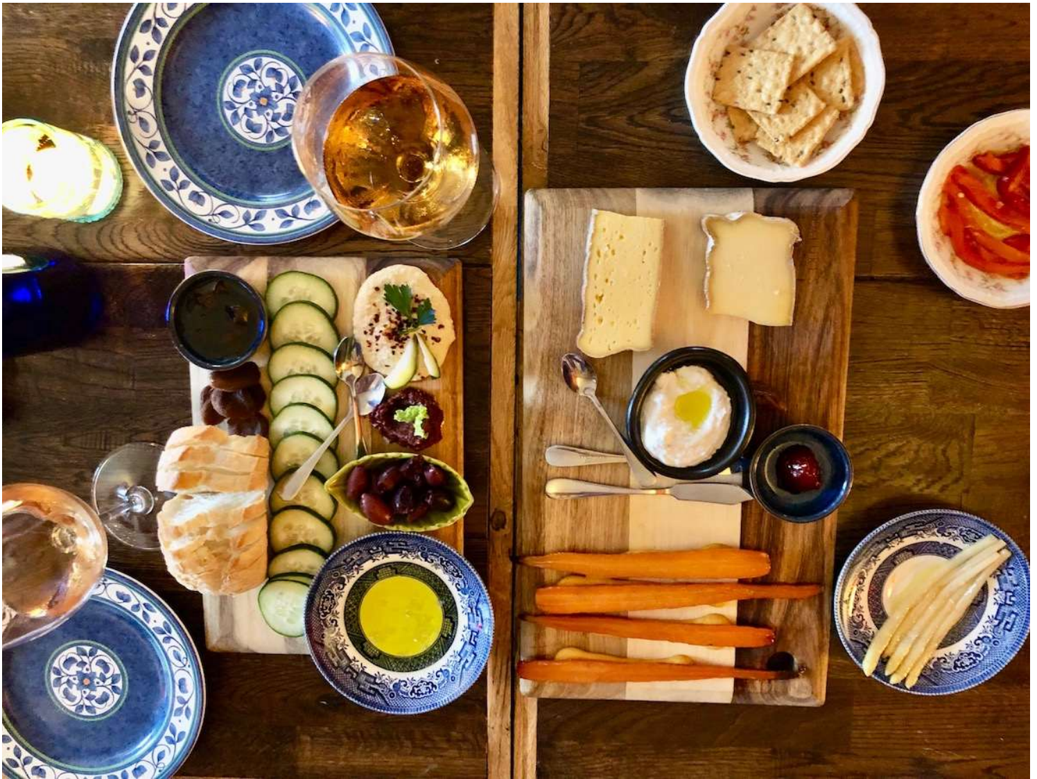
"AS A WINE PROFESSIONAL ... I WAS SURPRISED AND IMPRESSED WITH EVERY WINE I TASTED [AT GRANDIFLORA WINE GARDEN]."

Orapax is a traditional Greek restaurant with a few twists, like Greek eggrolls and Greek pizza. The menu is extensive, the servings are large, the food is good, and really, you can't go wrong here. I ordered the Greek chicken with a salad and pita and ended up with enough for dinner, too. The dining room is a large, casual, open room that can get quite loud. If that's not for you, sit in the bar at one of the high tops. There's also a smaller and quieter dining room at the front of the house. Orapax is open daily for both lunch and dinner.