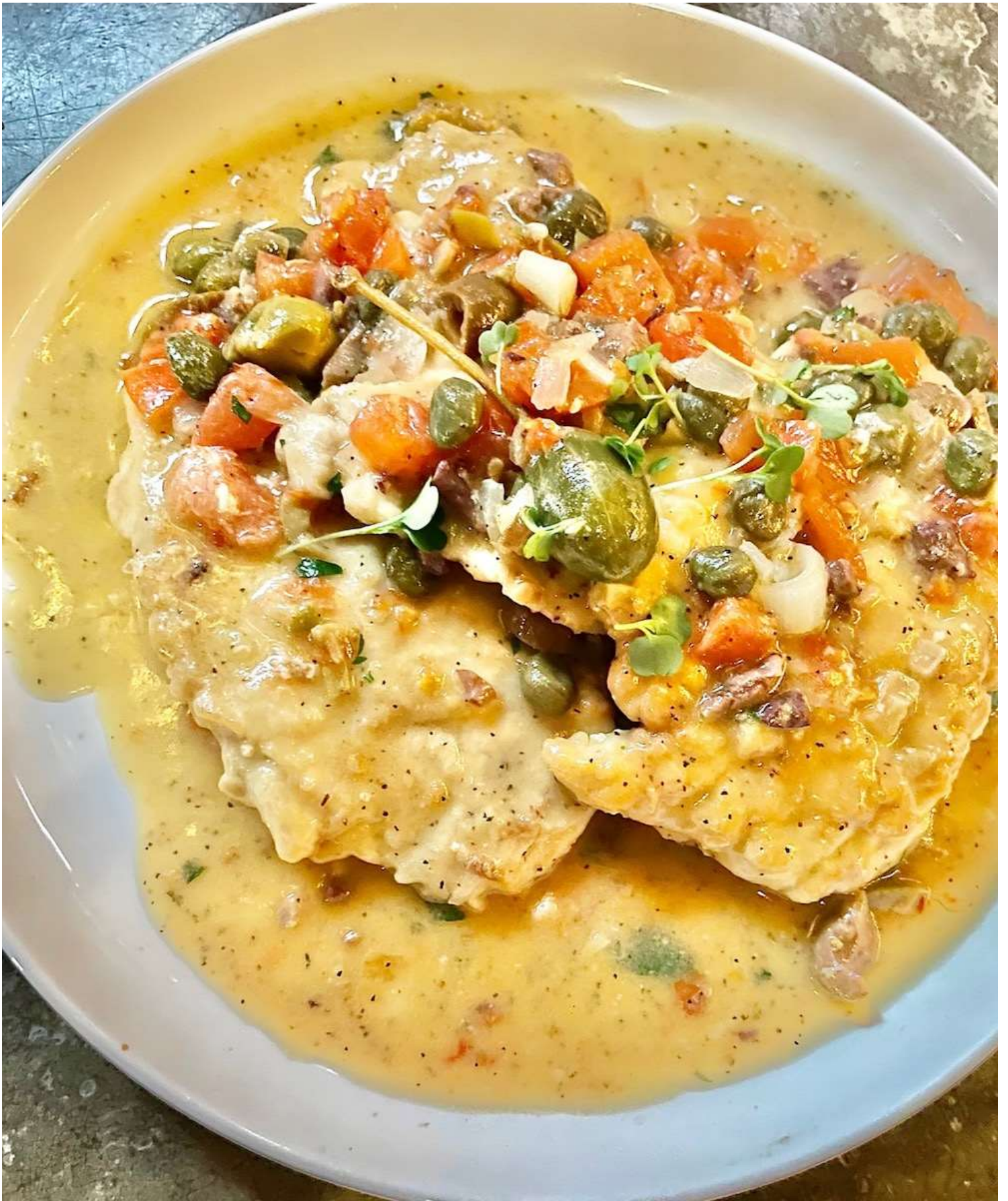
POLLO AL LIMONE, OR LEMON CHICKEN, SERVED WITH CAPERS, TOMATO, AND WHITE WINE SAUCE